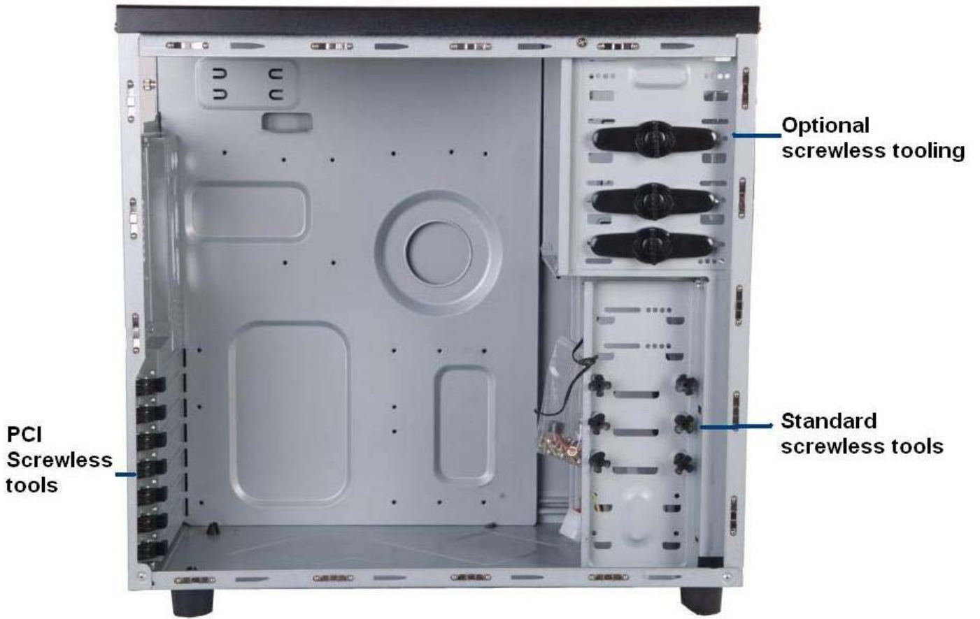
HJA FRONT/REAR VIEW